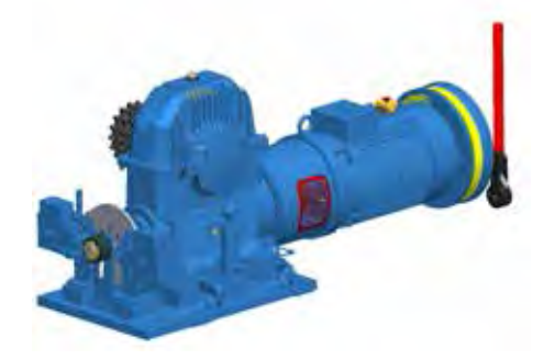
Traditional drive incorporating flange-mounted motor including coupling and cooling fan.