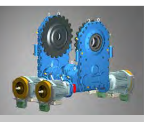
Double direct drives with double inputs.