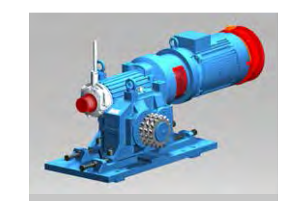
WH Series compact drive.

There are now even greater demands on escalator manufacturers in the heavy-duty mass transit sector as modern new stations are designed and constructed with significantly less space available for the escalator's drive system and its associated components. The technical solutions to meet the requirements of transit authorities and building designers is coming from a close working relationship between the escalator and the drive manufacturers, beginning with the earliest consultation.