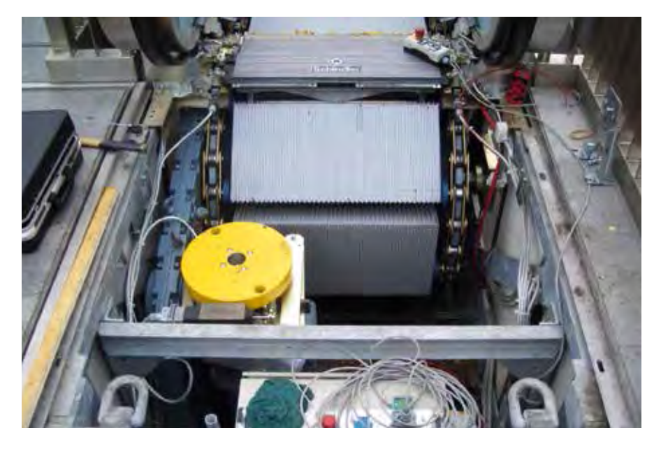
A single-input direct drive installation.

Renold Gears' direct drives are suitable for escalators in heavy use situations such as at busy underground stations. They can accommodate a variety of primary drive inputs from a stand-alone foot-mounted drive with coupling to multiple direct mounted inputs.